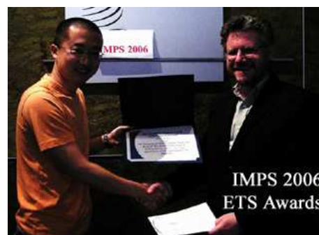
Congratulations also to the winners of the ETS Student Travel Awards!

Many thanks to everyone who attended IMPS 2006. This conference is for you, and would not exist without you.