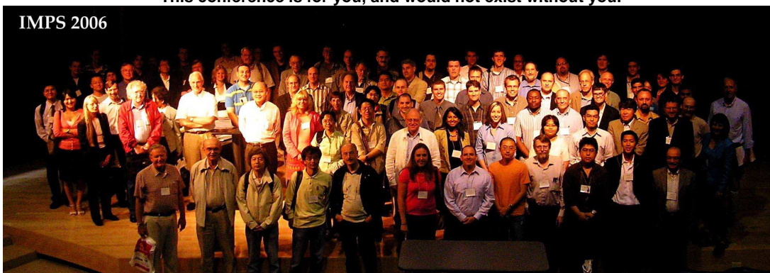
More group pictures are available here , including shots of the crowd at the Opening Session and the crowd watching the big game.

Many thanks to everyone who attended IMPS 2006. This conference is for you, and would not exist without you.